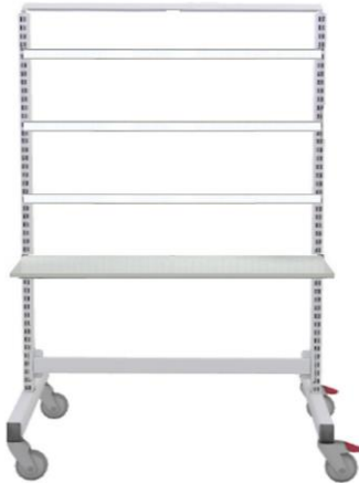
Training trolley with A4 frames