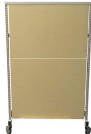
Back side of the trolley with storage place for chipboard and steel plates (2 pcs)