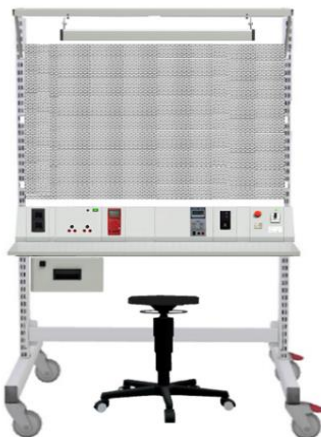
Training Trolley with perforated steel plate for electrical component installation including plastic towels and 100 pcs pan head screws