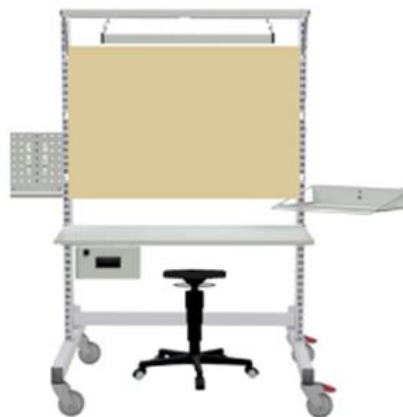
Training Trolley with chipboard plate for electrical component installation