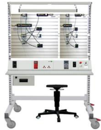
Training Trolley with pneumatic installation plates