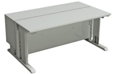
HELP6S20 flat work surface

HELP6S20 storage space equipped with A4 frame