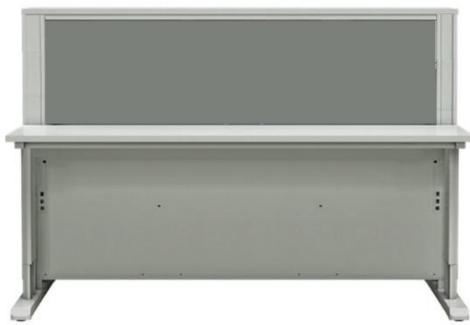
HELP6S20 storage space available