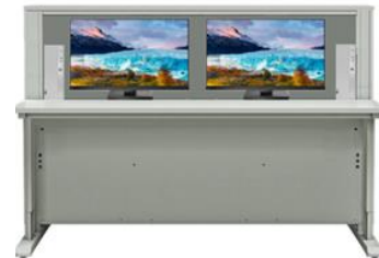
HELP6S20 storage space equipped with PC:s

HELP6S20 storage space equipped with A4 frame